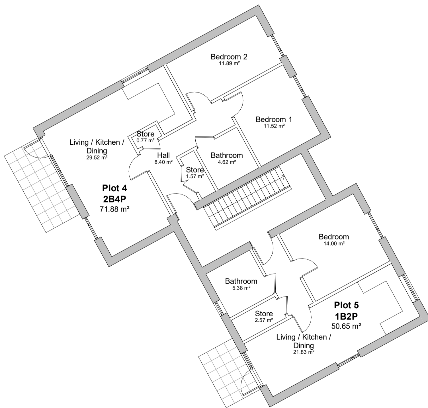
First Floor 1 : 100